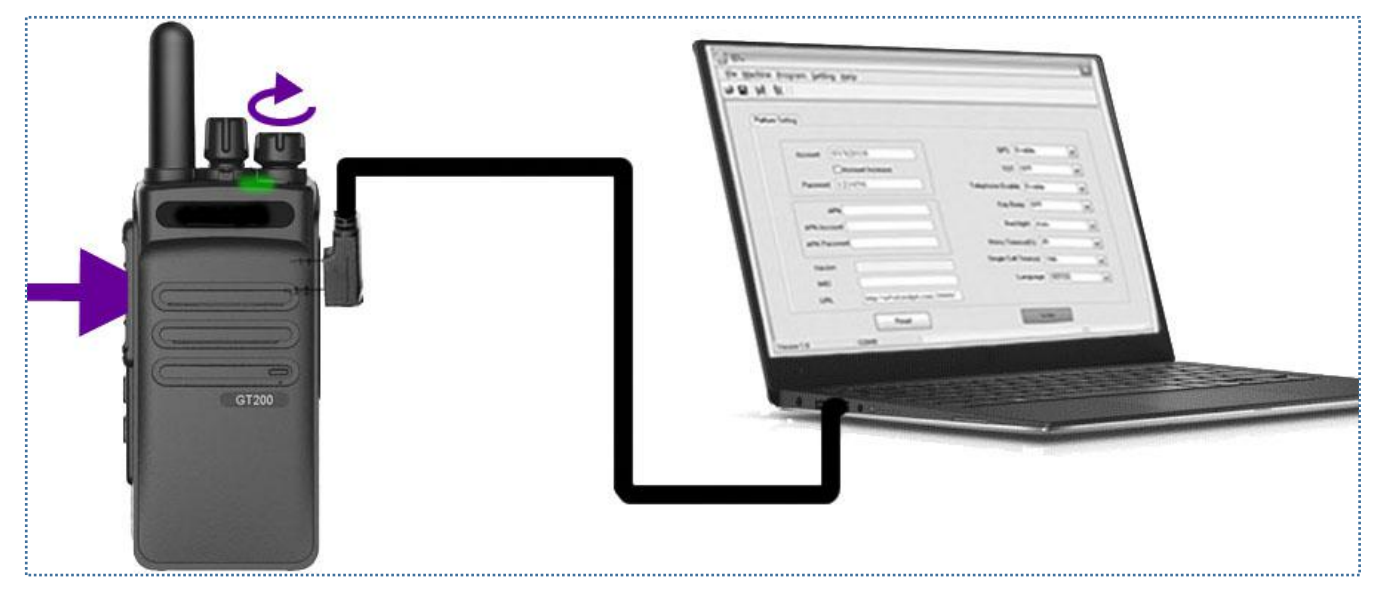
◆ fulfill your RealPTT ID (please order from Anysecu) into the software, (for example account:SVS2018; password:123456)